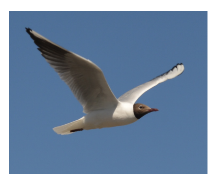
B ARCTIC TERN