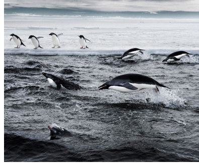
D ADELIE PENGUIN