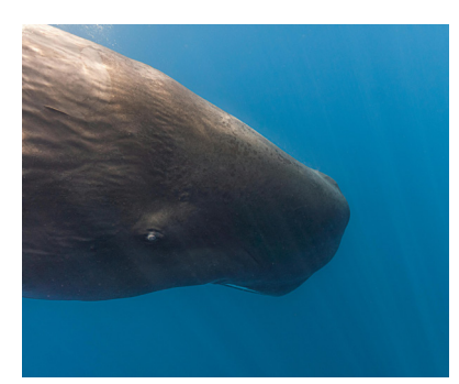
F SPERM WHALE